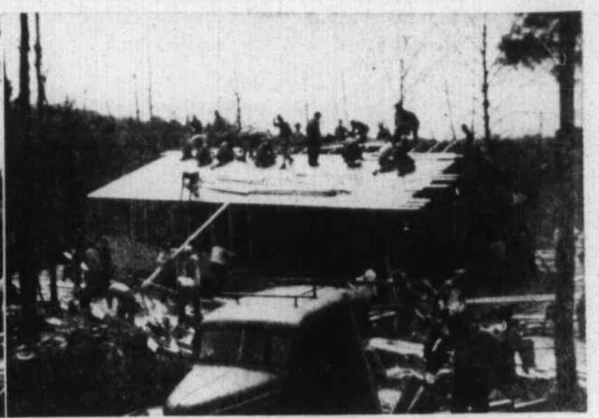
At three o'clock the house had gotten to this point. The family was moved in at eight that night, and needless to say, everyone was overjoyed.