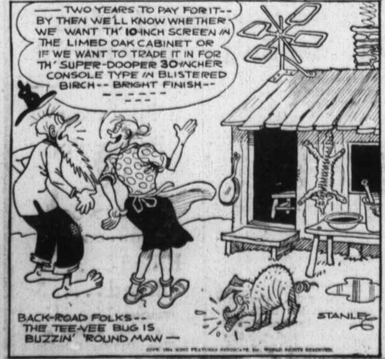
BACK-ROAD FOLKS-- THE TEE-VEE BUG IS BUZZIN' ROUND MAW--