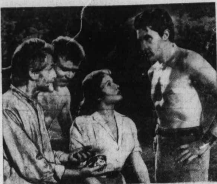
MORGAN FARLEY, Brian Keith, Rhonda Fleming and Fernando Lamas discover a fortune in hidden gold in this scene from Paramount's brand new action-loaded romantic adventure, "Jivaro," which is due to open Thursday at the Park Theatre. Filmed in Technicolor, "Jivaro" is set in the midst of the wild and treacherous Amazon jungle.