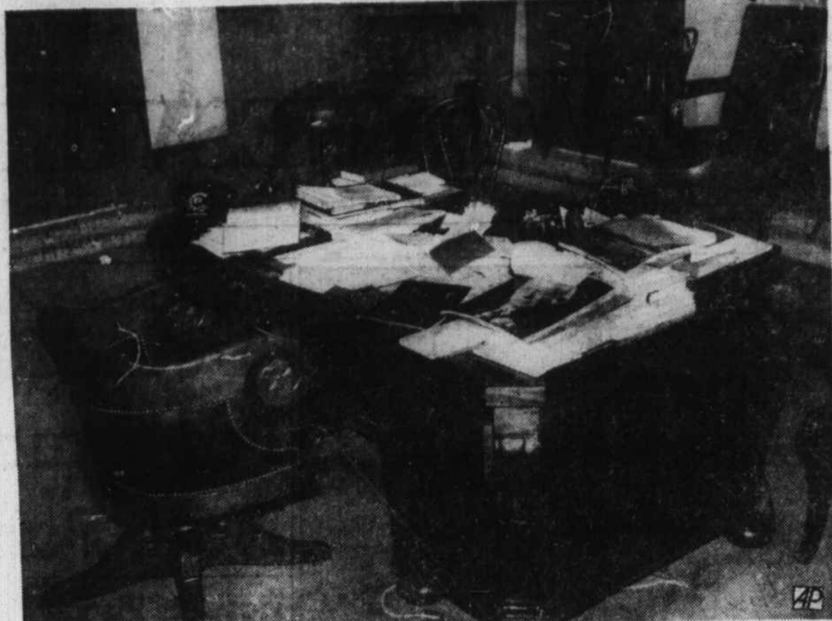
MAIL REMAINS UNSIGNED ON SENATOR HOEY'S DESK —Outgoing mail lays unsigned on the desk of Senator Clyde Hoey (D-NC) as it was at the time of the Senator's death while napping in the chair at left, May 12.

MONDAY, MAY 17 Last Chance To See This Exciting Feature In 3-D and Color! "DON'T MISS IT!" "PHANTOM OF RUE MORGUE" Starring KARL MALDEN PATRICIA MEDINA STEVE FORREST TUES. & WED., MAY 18 & 19 "PARIS PLAY BOYS" LEO GORCEY And The BOWERY BOYS — ALSO — ALWAYS THE BEST IN SELECTED SHORT SUBJECTS THURS. & FRI., MAY 20 & 21 "JIVARO" (In Color) Starring FERNANDO LAMAS RHONDA FLEMING