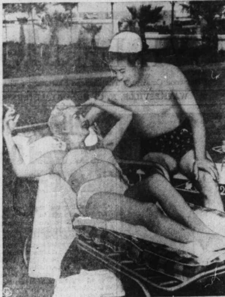
VACATIONING in Las Vegas, actress Betty Grable shields her eyes from the bright sun as she talks to her husband, bandleader Harry James. They are taking a rest between engagements.