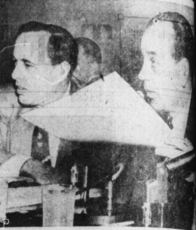
JOHN G. ADAMS, Army counsel, holds a copy of President Eisenhower's letter to Secretary of Defense Charles E. Wilson barring him on secret Executive Department talks, as he returns to the state investigations subcommittee, ordered the Defense Department keep secret discussions relating to the Army-McCarthy dispute. Adams is James St. Clair, special assistant Army counsel.