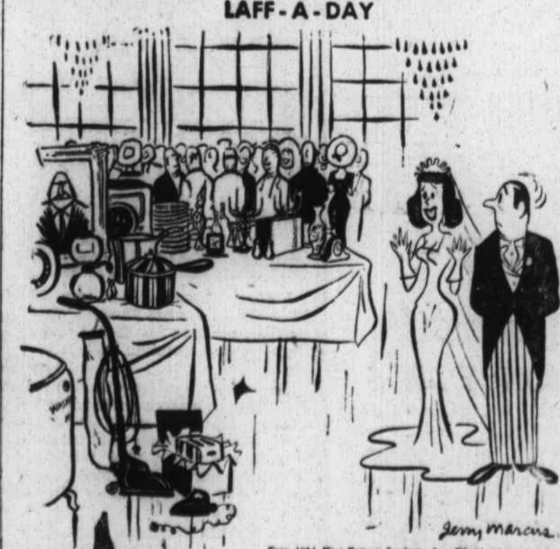
"How wonderful! Even gift for a cook and maid!"

March production of total non-fat dry milk solids was the highest for the month in 20 years on record—131,650,000 pounds, 18 per cent above a year earlier.