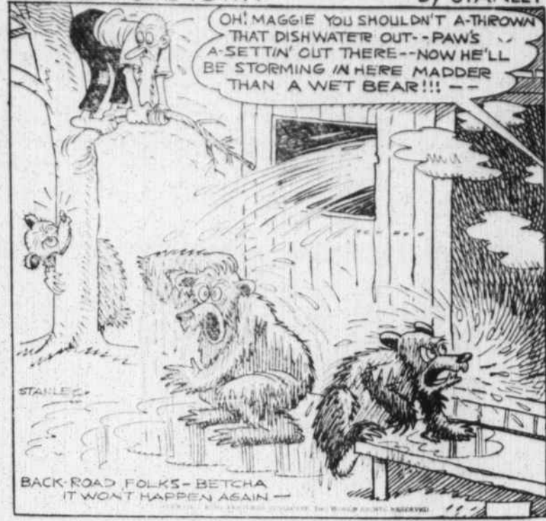
BACK-ROAD FOLKS—BETCHA IT WON'T HAPPEN AGAIN