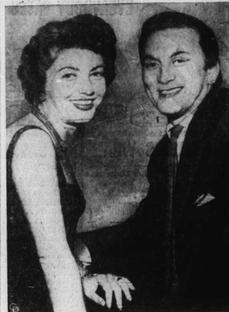
HE-MAN SCREEN STAR Kirk Douglas and his bride, Anne Buydens, 31, smile blissfully after their marriage in Las Vegas. Douglas, 37, and the blonde Parisienne met last year in the French capital while he was working on a film. It is the second marriage for both.