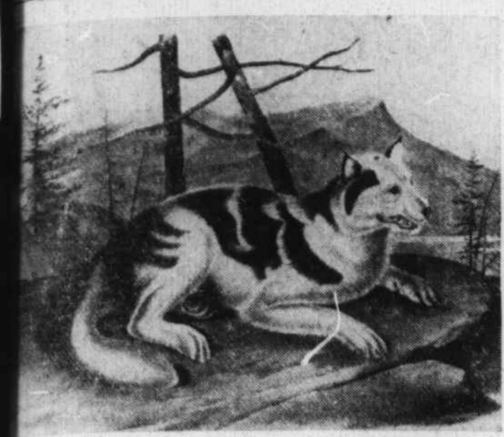
PRINT will be among the series of 19 drawings by the famous naturalist, John James Audubon, to be exhibited from June 30 through July 10 at the First National Bank. The exhibit is being brought to Waynesville by the L. N. Davis Co., agents for The Travelers Insurance firm.

YOU ARE CORDIALLY INVITED TO ATTEND A SPECIAL EXHIBITION OF AUDUBON ANIMAL PRINTS Through The Courtesy Of THE TRAVELERS INSURANCE COMPANY JUNE 30 - JULY 10 AT THE FIRST NATIONAL BANK Sponsored By THE L. N. DAVIS CO.