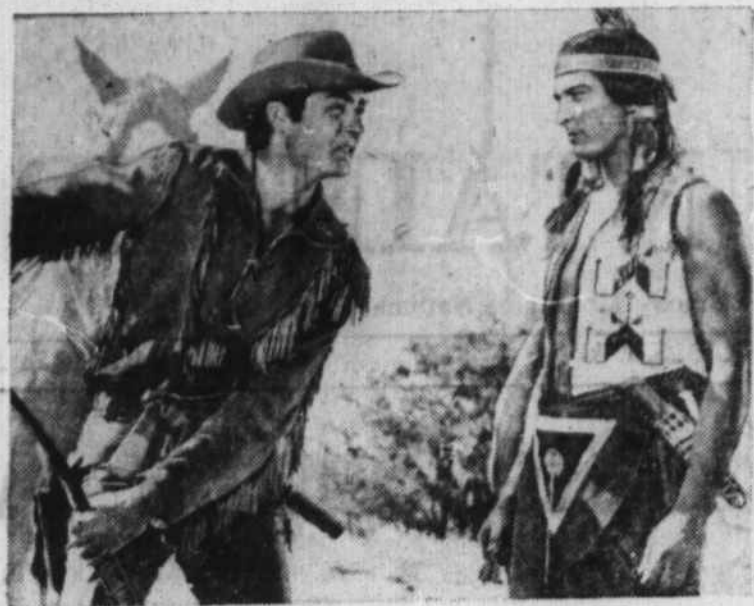
A PEACE PACT between Indian scout Rory Calhoun and Cheyenne Indian Brave "Fire Chief" starts the thrills in the United Artists' release in color "The Yellow Tomahawk" opening at the Strand Theatre on Sunday.

SUN., MON., TUES. & WED., JULY 18, 19, 20 & 21 "FROM HERE TO ETERNITY" Starring BURT LANCASTER MONTGOMERY CLIFT DEBORAH KERR FRANK SINATRA DONNA REED