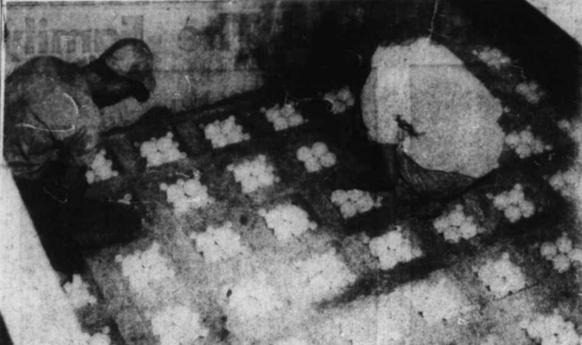
PORCELAIN BALLS of various sizes are placed on the bottom of filter beds in Waynesville's new filtration plant, which will start operation some time in August. Stone will be placed on these balls and on that a layer of sand to provide an effective filtration base.