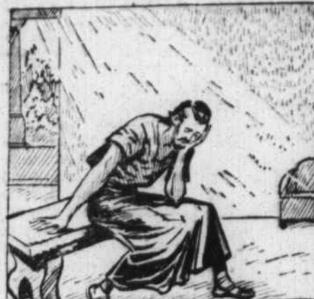
When one is troubled in mind, worried over a problem that seems unsolvable, think of the Psalmist's words, "Be still and know that I am God," and take comfort.

Scripture—Psalm 46:10; Isaiah 40:30, 31; Luke 11:1-13; Philippians 4:6-7; Hebrews 1:14-16.