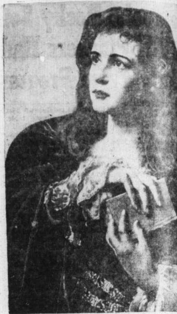
"Rejoice evermore; pray without ceasing. In thanks; for this is the will of God in Christ Jesus our Lord."—Thessalonians 5:16-18.

Old Folks Service each third Sunday night at 8 o'clock.