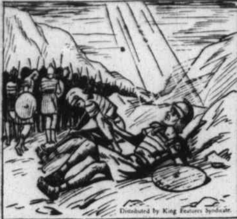
"Even the youths shall faint and be weary, and the young men shall utterly fall; but they that wait upon the Lord shall renew their strength."—Isaiah 11:30, 31.