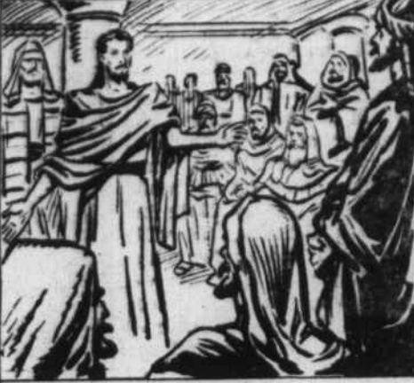
Jesus' disciples asked Him to teach them how to pray, and He said: "When ye pray, say, 'Our Father which art in heaven, hallowed be Thy Name, Thy kingdom come.'"