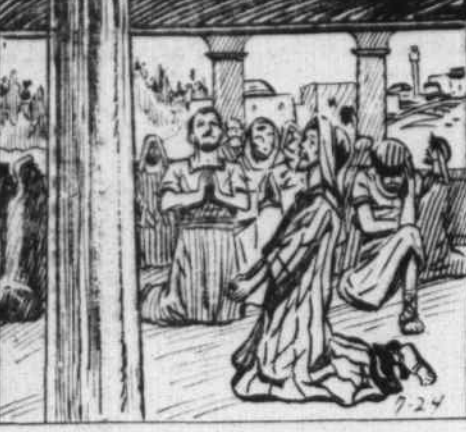
"Be careful for nothing, but in everything by prayer and supplication with thanksgiving, let your requests be made known to God." MEMORY VERSE—Thess. 5:16-18.