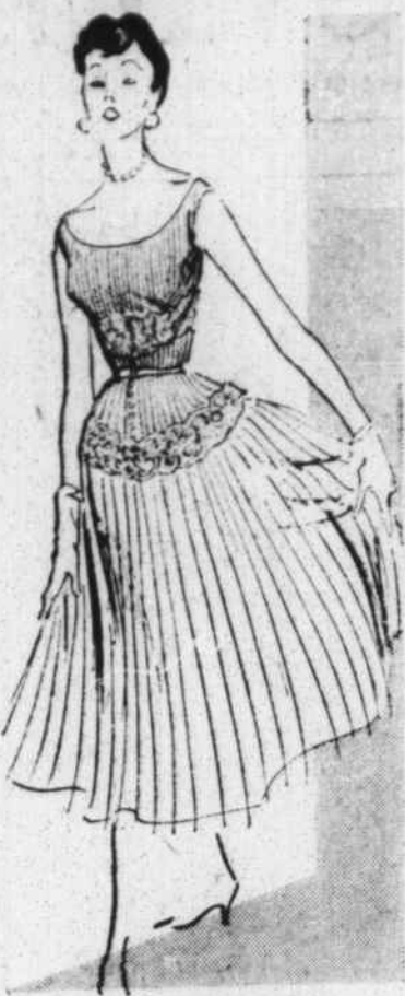
By VERA WINSTON

PERFECT for an important date or an informal dance is this charming dress, the fabric fine linen, the color beige or pastel shades. Delectable detailing marks the frock which is sleeveless and has a simple, rounded neckline. It is tucked from neck to hem, the tucks widening in their descent. Bands of heavy cotton lace, dyed to tone, are inserted in curved lines on the bodice and hip yoke for a dressy touch.