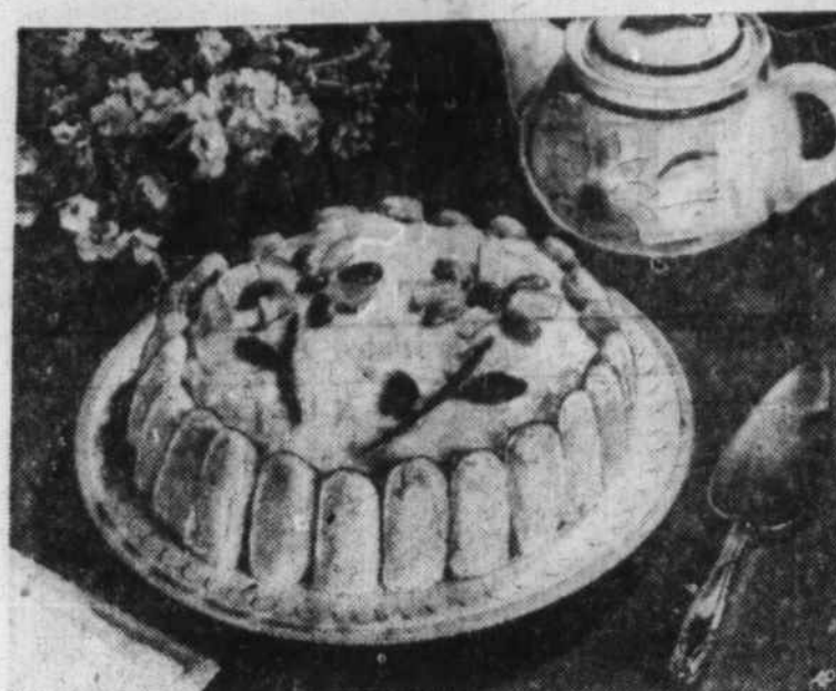
PINEAPPLE TRIFLE — Takes its cue from the famous English dessert.

By CECILY BROWNSTONE Associated Press Food Editor