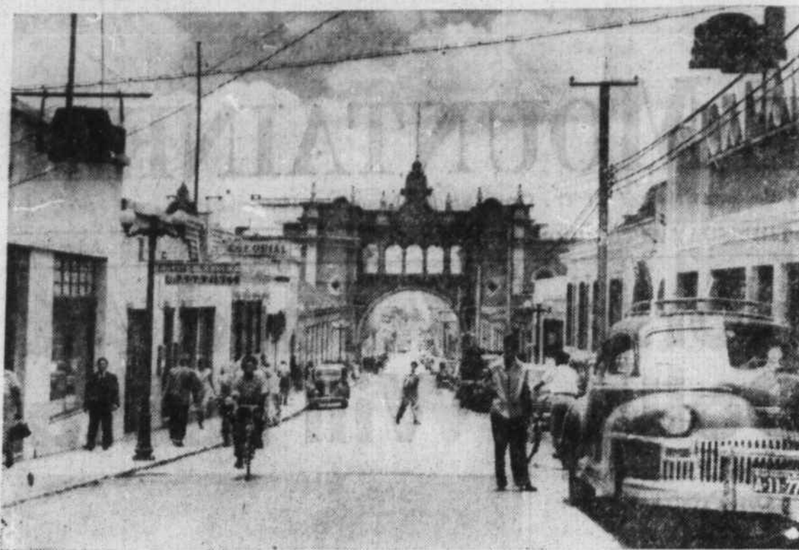
THE MONTH-OLD anti-Communist government of Guatemala announced that a group of 300 military cadets and others revolted in Guatemala City (above) and that many persons were killed in bitter fighting. The uprising, according to official spokesmen for President Carlos Castillo Armas, was led by leftist elements of the fallen regime of ex-President Jacobo Arbenz Guzman, who obtained asylum in the Mexican Embassy at the time that the "liberation army" under Armas overthrew Arbenz.