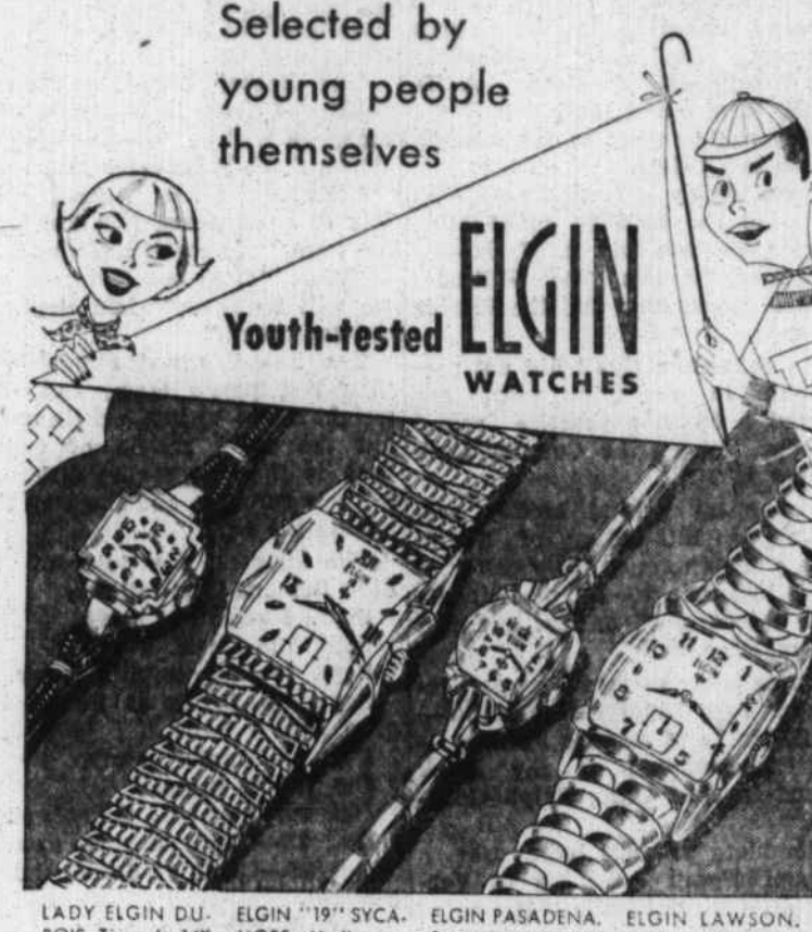
BOIS. Tiny. In 14K MORE. Hadley ex- Expansion bracelet. Rich expansion gold. 21 jewel pansion band. 19 17 jewels. Curved band. 17 jewel movemovement, $85.00 jewels. $69.50 crystal. $45.00 ment.