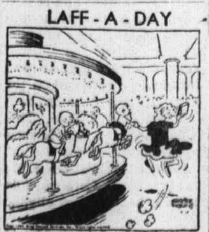
"Don't be afraid, dear-let go of Mother's hand!

Q. My mother has a fit because safe efficient method. No matter boy I like hangs around the what you hear razor cutting will