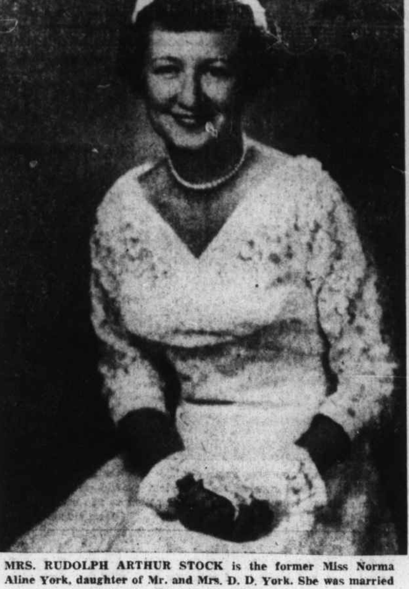
Saturday at noon in the First Baptist Church.