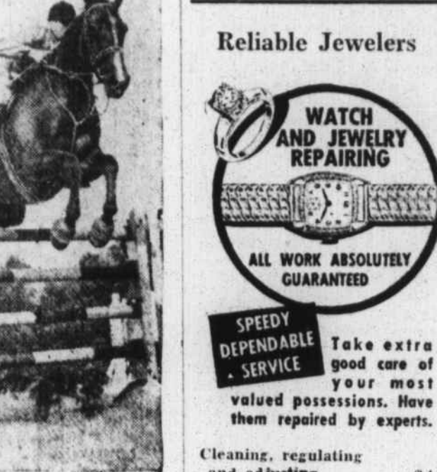
and adjusting $1.50 Balance staff, cleaning and adjusting $5.50 Stem and Crown $2.50 Main Spring $2.50 All Crystals $1 up

All Repairs By Reliable Jewelers Carry A One Year Guarantee Why Pay More?