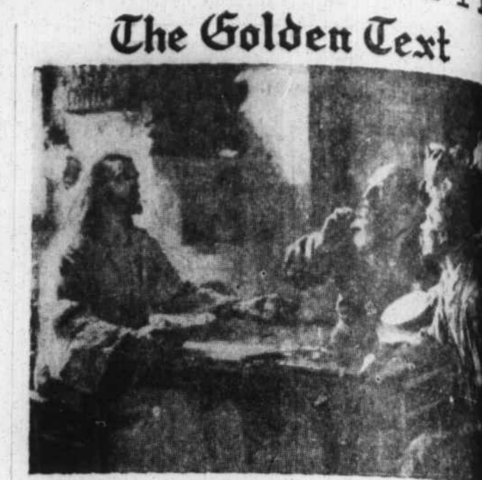
Christ blessing the evening meal. "My son, keep thy father's commandment, and forsake not the law of thy mother."—Proverbs 6:20.