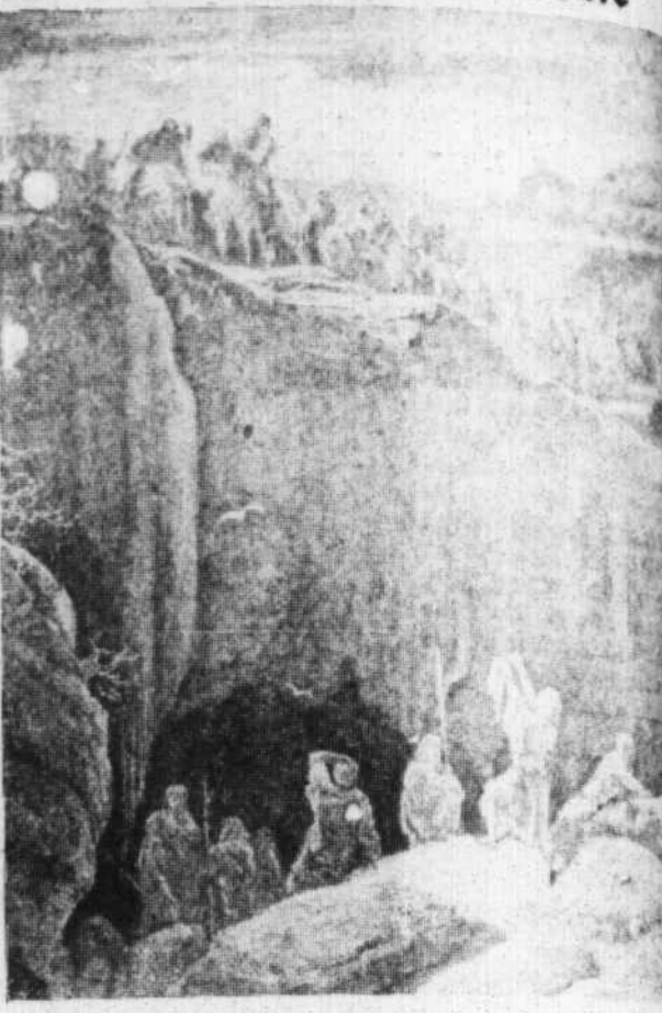
David showing Saul that he had spared his life. "He that is slow to anger is better than the mighty, and he ruleth his spirit than he that taketh a city."—Proverbs 16:32.

"He that hath no rule over his own spirit is like a city that is broken down."—Proverbs 25:28. MEMORY VERSE—Proverbs 16:32.