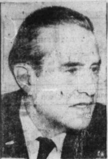
W. AVERELL HARRIMAN, candidate of the Democratic and Liberal parties, was elected governor of New York over Republican Senator Irving M. Ives. Harriman came through with a bare 10,000 or so margin out of five million votes cast.