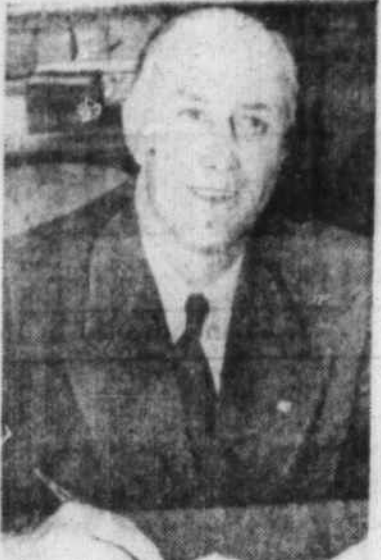
J. STROM THURMOND, former South Carolina governor and presidential candidate on the States Rights ticket in 1948, was elected to the U. S. Senate Tuesday in a national precedent write-in campaign.