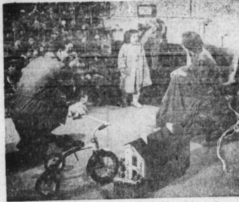
"THE HOME TAKES ON A HAPPY GLOW of heartfelt Christmas cheer" that can be captured to live throughout the years when dad is equipped with a camera to record it all on movie film.

The Toy Guidance Council furnishes many retailers with consumer leaflets for free distribution in which all types of playthings are classified as to age suitability.