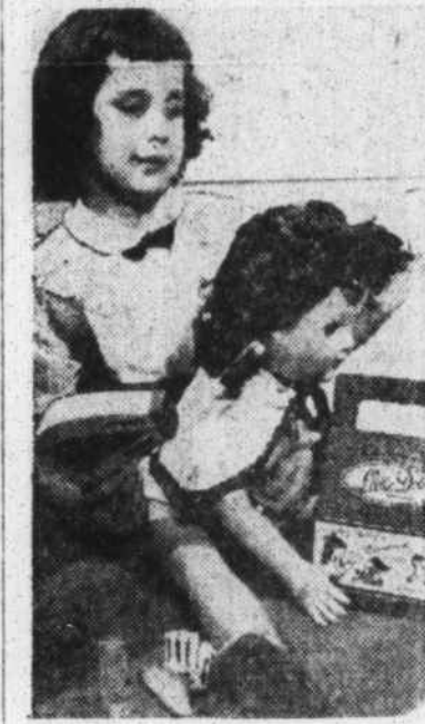
TIME TO WASH dolly's hair? No problem when you can blow it dry in minutes with this new non-electric blower.

wooden shaving bowl or bottle of toilet water to a deluxe travel kit, fitted out with everything a man needs to keep him looking his best at all times.