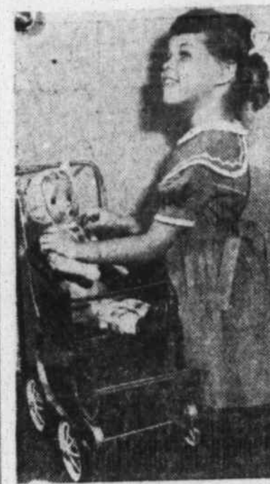
FRESH AND CLEAN and ready to go! Doll's faded blue denims are zipped for quick 'n easy sudsing come wash day. Many dolls offer costume changes.

The modern emphasis is on "do-it-yourself" or "make-it-yourself." The ingenuity of the Toy Manufacturers of the U.S.A. has brought Santa his most exciting toy collection in years.