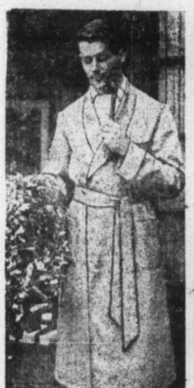
MAKING IT DRESSY this year when you choose a robe for him. It can be practical too, with all-Dacron models such as this one.