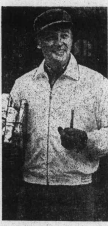
CALLER "ANTI-FREEZE" this jacket of all-nylon is a gift of comfort as well as smartness for any man's leisure.

MAKE IT DRESSY this year when you choose a robe for him. It can be practical too, with all-Dacron models such as this one.