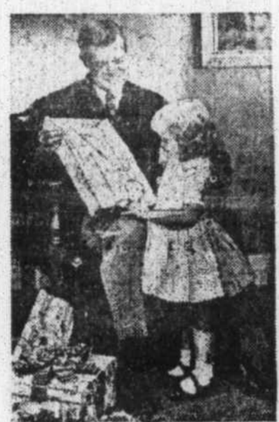
FROM SISTER TO POP, new shirts which are easy for her to choose and just what he always needs. Smartly pin striped styles in soft blue on white are of sanforized broadcloth.

MAKE IT DRESSY this year when you choose a robe for him. It can be practical too, with all-Dacron models such as this one.