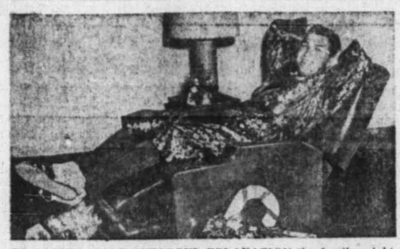
TO ASSURE HIM WONDERFUL RELAXATION the family might well consider clubbing together to give one of those luxurious countercouch chairs that automatically recline to his favorite lounging position. Available in fabric or colored leathers.

It requires 750 gallons of water to produce a ton of Portland cement.