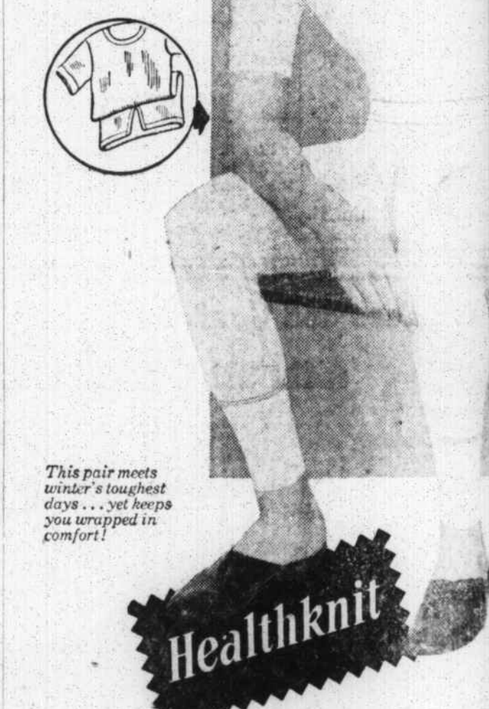
This pair meets winter's toughest days... yet keeps you wrapped in comfort!