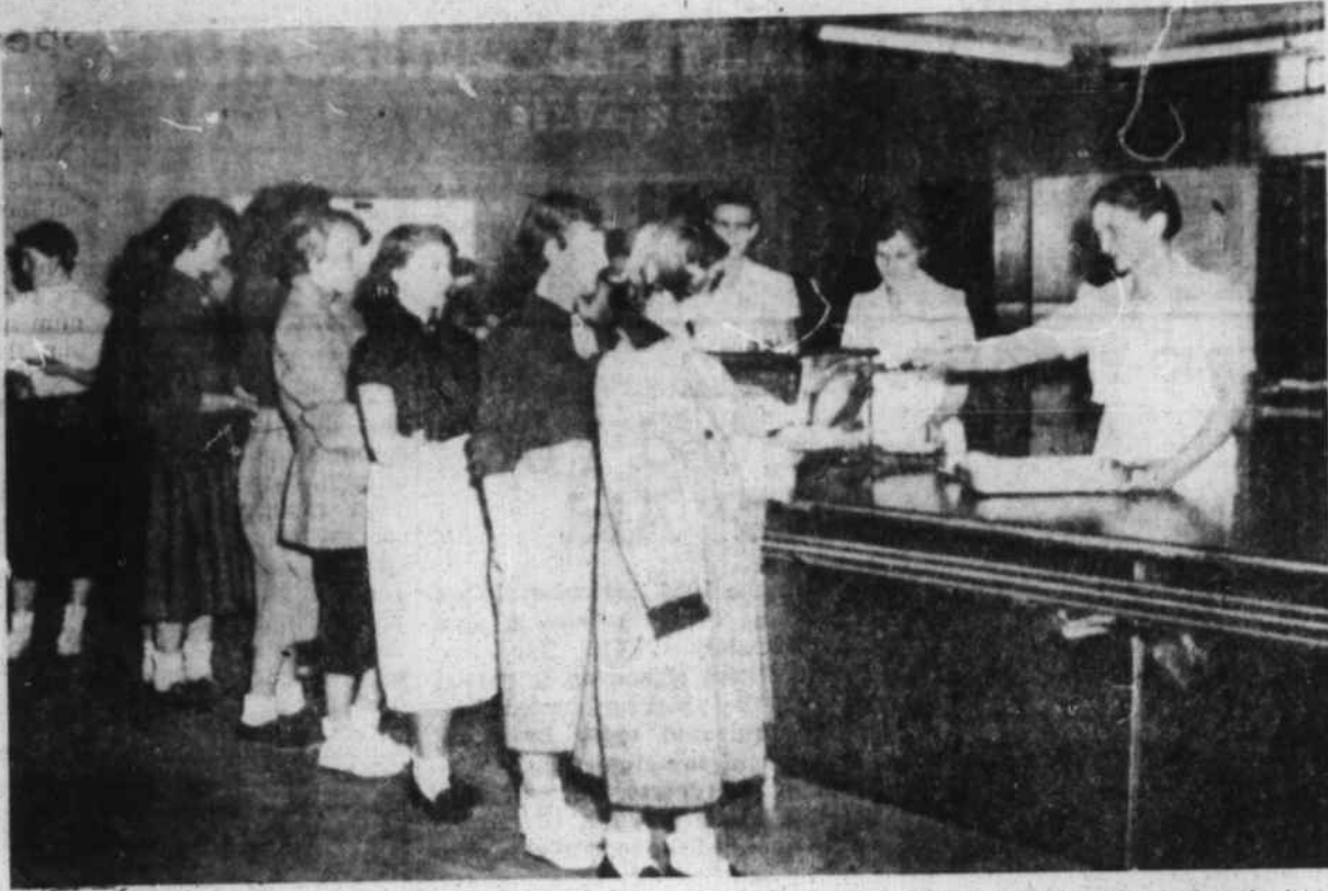
'CHOW TIME' AT BETHEL finds these students at the serving line of the school's new cafeteria, which seats more than 400 students at one time and feeds more than 900 daily. The cafeteria is in Unit B, one of three to be dedicated at Bethel next Wednesday night.