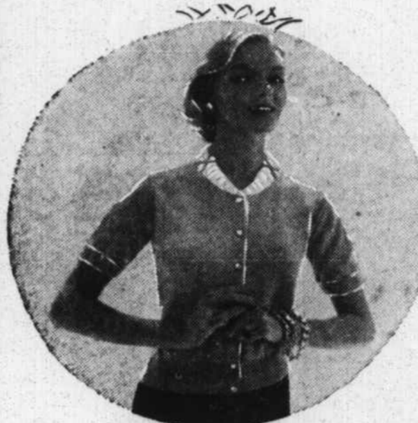
Short sleeve cardigan in 100% Virgin wool Goralam, white angora collar. Moonstone, sunshine, lilac dust. Sizes 34-40.

Pretty Ways To Say She's Lovely - - - and Merry Christmas, Too!