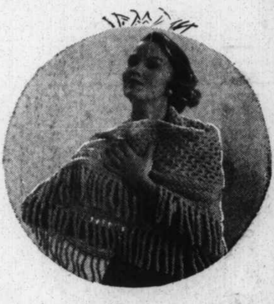
Shaped like a mantilla—lacy wool knit stole in white, pink, blue, black.