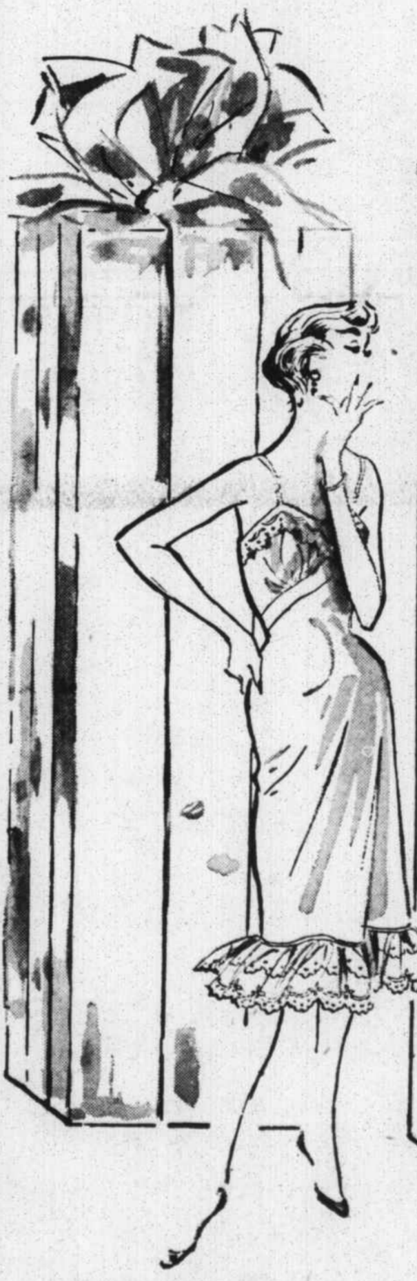
Opaque nylon tricot slip with embroidered top and hem. White only. 32 to 40.