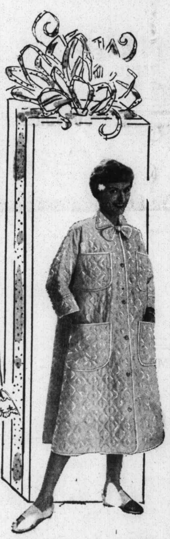
Quilted Reverie crepe duster. Blue, turquoise, shocking pink. Sizes 10 to 18.