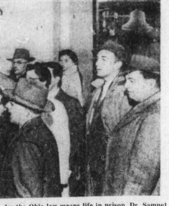
der the Ohio law means life in prison. Dr. Samuel Sheppard was tried for the death of his 31-year-old wife last July fourth.