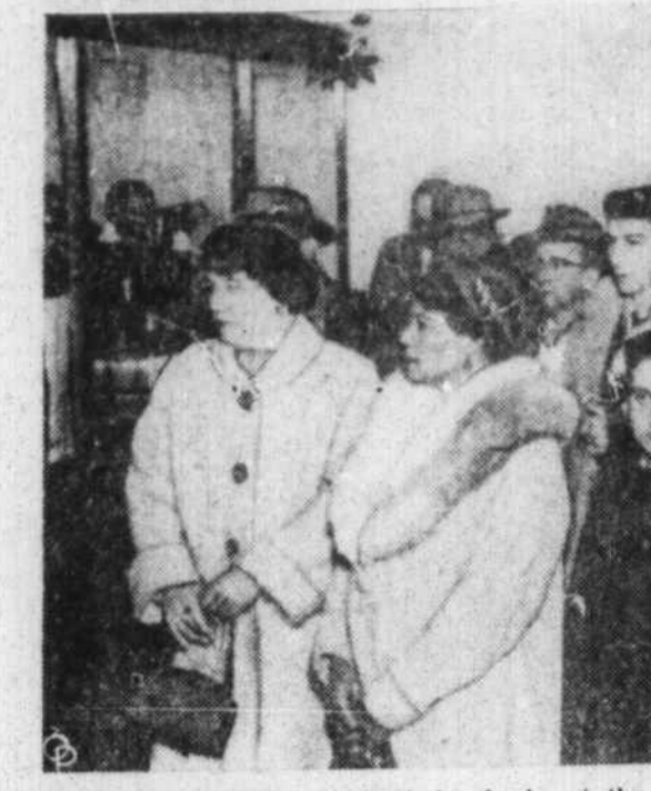
SHEPPARD JURORS await their checks at the clerk of court's office in Cleveland. Shortly after this picture was made, the jury returned a verdict of guilty of second degree murder, which un-

About 46,000 miles of road will be built in the United States in 1955.