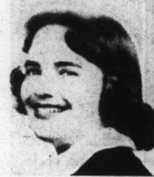
By PEGGY REEVES