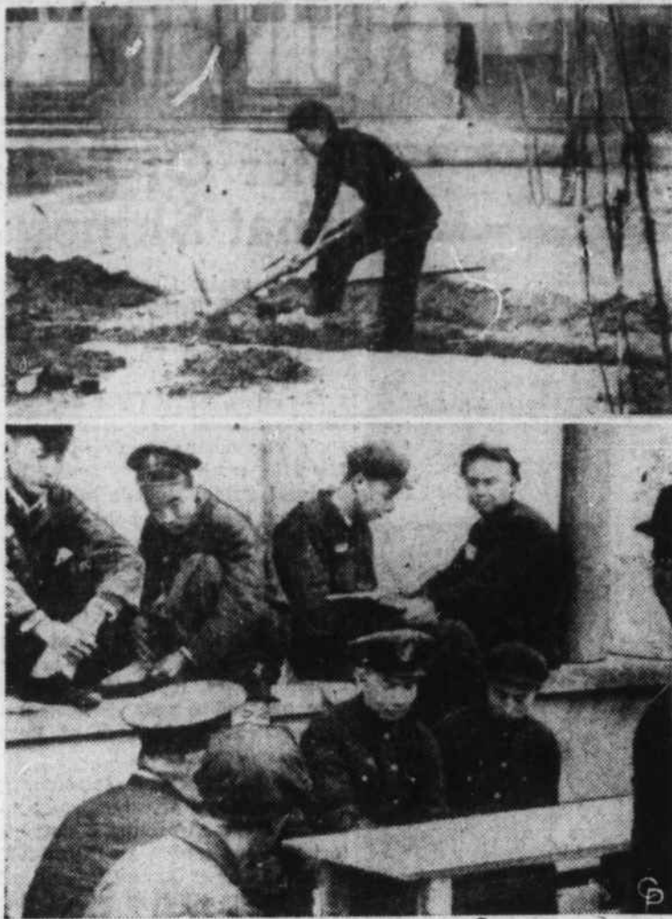
IN THESE RARE PHOTOS taken inside Red China, a woman is shown (top) digging ditches in a residential section of Canton once occupied by western traders who were permitted to set up a walled concession. At bottom, a Chinese Red officer in Peiping gives a typical neighborhood group a few lessons in "right thinking" where the "official line" in politics is concerned.