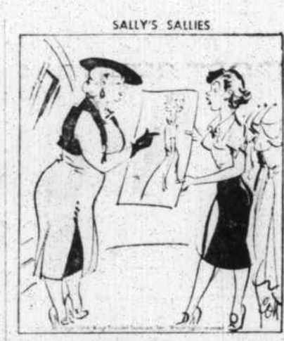
"That's what I want - the DIOR LOOK!"