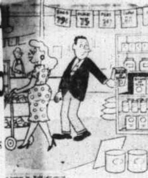
e are shopping for our very first meal!"