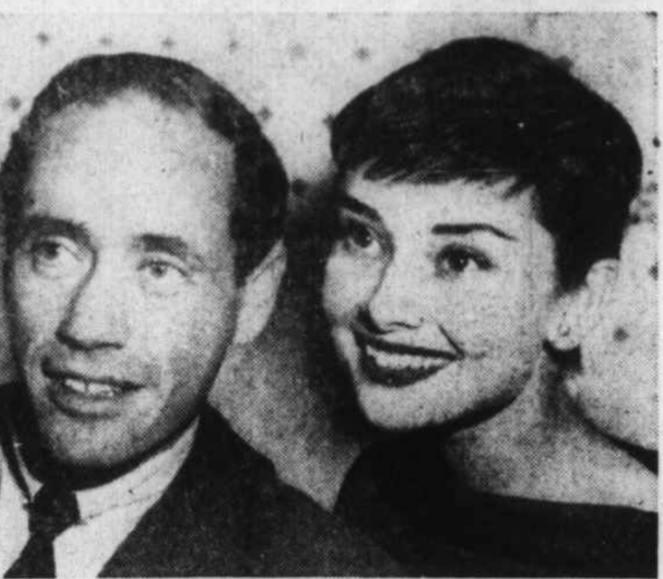
RADIANTLY HAPPY are Audrey Hepburn, Oscar winning actress, and her husband, Mel Ferrer.