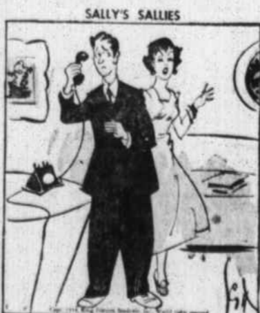
"Tell him you can't go. Didn't he hear me say NO?"

A special film on polio, "They Shall Not Want," will also be shown.