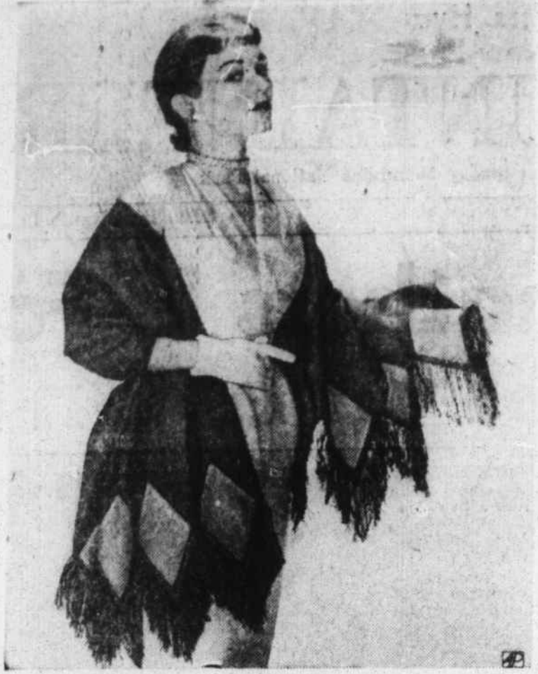
SPRING ACCESSORY . . . Diamond-appliqued stole, easy to make at home, fun to wear with many costumes.