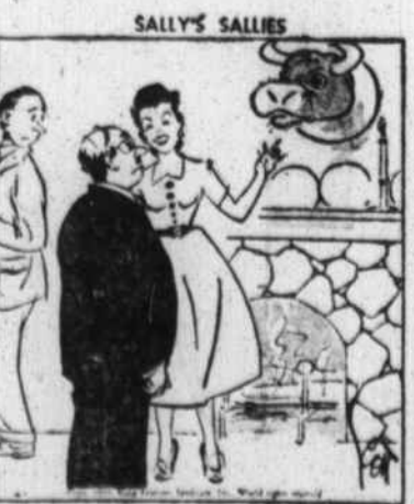
"When my husband goes hunting he always brings back something."