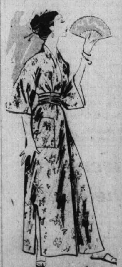
By VERA WINSTON

BACK in favor again is that most charming of Oriental apparel, the kimono. Designed to charm the man of the house, to surprise guests, to delight any leisure hour, is this pretty example fashioned of acetate and cotton damask all bright with a print of butterflies on a lotus pink ground with a matching obi sash.