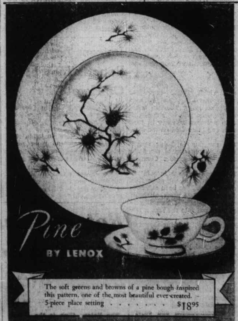
The soft greens and browns of a pine bough inspired this pattern, one of the most beautiful ever created. 5-piece place setting $18.95