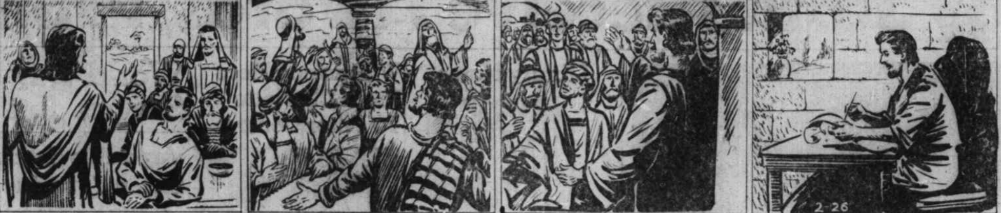
Jesus appeared to His eleven disciples and gave them His command, that they should go into the world and preach the gospel to all creation. When the Holy Ghost fell on the disciples, they talked strangely, seeming to be drunk. Peter, standing with them, told the people to listen to his words. Then Peter talked of Jesus whom they had crucified but who was raised from the dead, and he called upon his hearers to repent and be baptized. "Whoever shall call upon the name of the Lord shall be saved." But how could they believe without a preacher? MEMORY VERSE—Romans 1:16.