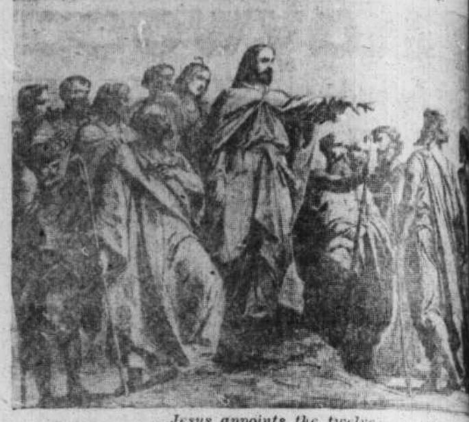
Jesus appoints the twelve. "For I am not ashamed of the gospel of Christ: for it is the power of God unto salvation to every one that believeth; to the Jew and also to the Greek."—Romans 1:16.