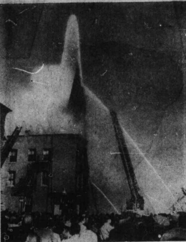
WATER FROM A high-pressure hose hits the spire of the First Full Gospel Church in Baltimore and is deflected to make a spectacular fire-fighting scene. Three hundred persons in adjacent buildings were driven out by smoke. Four firemen were injured fighting the six-alarm blaze, which occurred during a cold wave.

baked in England, decorated in France and framed in the United States," for $2. Of course there are many other things, but what strikes one about the place is the fact that our world seems to have grown mighty small.