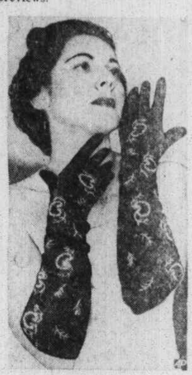
rhinestone-embroidered evening gloves are of dark reindeer skin, designed by Perrone Amadeo,

become so discolored that ordinary Renowned as the home of some washing and bleaching will not re- of the world's most skilled shoe store their whiteness? If so, we and glovemakers, Italy is attracting suggest a method which should many buyers from American shows. make them look fresh and white. not only for its high-fashion dres-It is important to follow the steps ses and costumes; but for accesin the order given - many gar- sories as well. Following are some ments may not need all the steps of the highlights of the spring