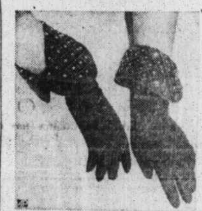
JEWELED GAUNTLETS . . . Another version of reindeer evening gloves with jeweled cuffs,