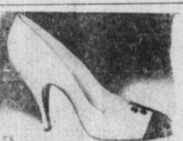
SPECTATOR PUMPS . . . Rose color kidskin in pearly finish makes these morning shoes, with black trim,