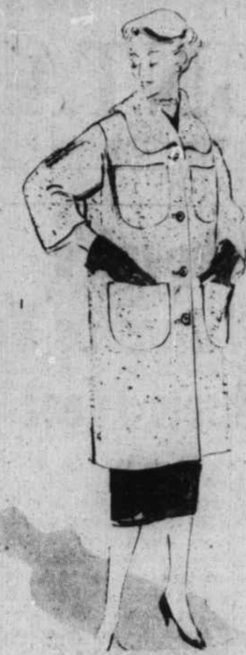
By VERA WINSTON

A GOOD travel ticket, a nice choice for town or country wear is this three-quarter length coat fashioned in off-white oatmeal tweed. It is very much of the mode which means that it makes last year's coat look obsolete—and that's just what fashion folk plan for. Straight yet boxy, it has just enough fullness to permit wearing it over a slim suit. Four curved patch pockets add to the line interest and there are four novelty white and gold buttons below the gracefully curved collar.