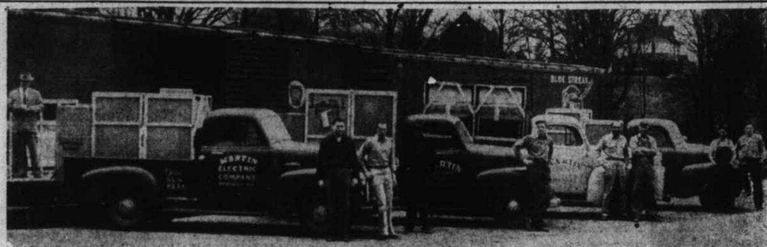
OVER 70 PIECES OF FRIGIDAIRE APPLIANCES HAVE BEEN UNLOADED FOR SHOWING AT MARTIN ELECTRIC COMPANY, FRIDAY, MARCH 25th.