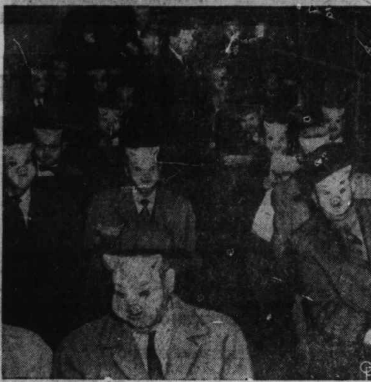
WEARING PIG MASKS, passengers on the West Shore Railroad protest an attempt by Robert R. Young, head of the system, to abandon passenger but not freight service between Orangeburg, N. Y., and Weehawken, N. J. They were recalling Young's slogan of some years back, which ran: "A hog can cross the country without changing trains—but you can't." The commuters' refrain has now become: "A hog can ride the West Shore—why can't we?"