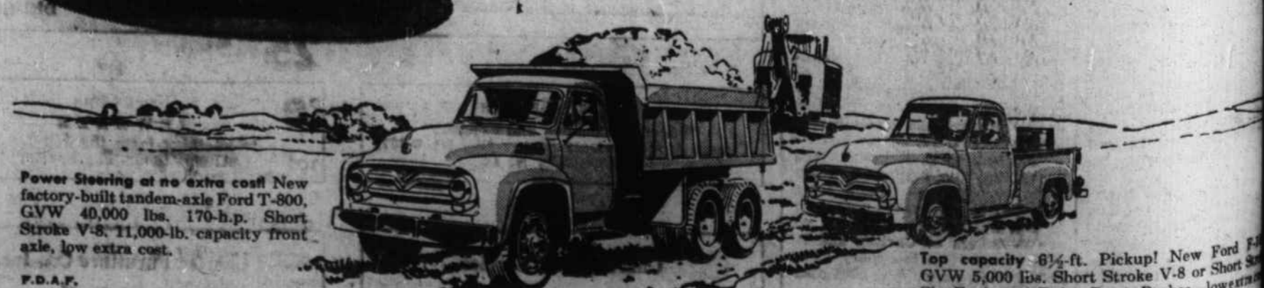
Power Steering at no extra cost! New factory-built tandem-axle Ford T-800, GVW 40,000 lbs. 170-h.p. Short Stroke V-8. 11,000-lb. capacity front axle, low extra cost.