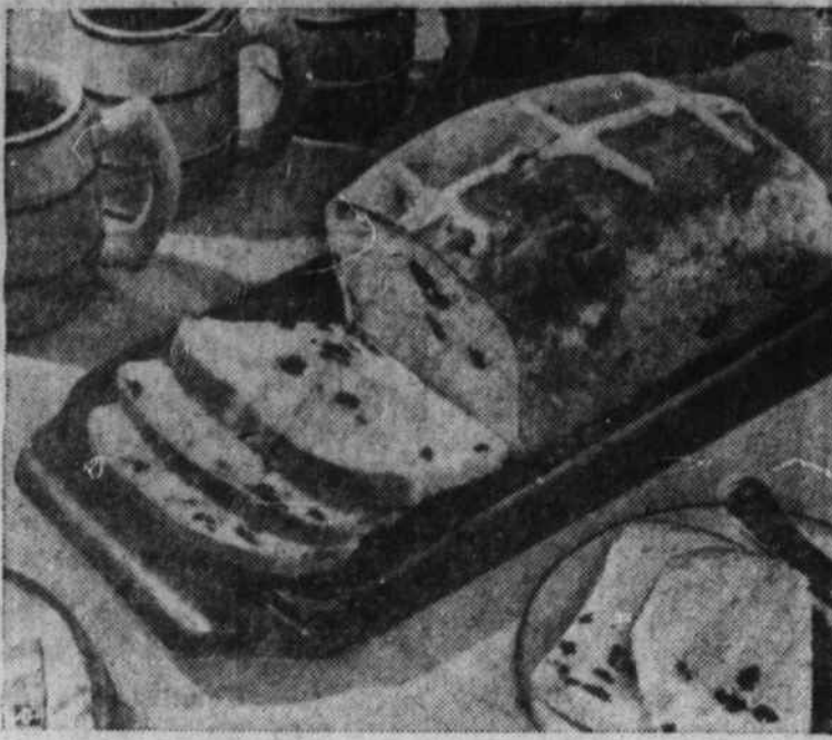
HOT CROSS LOAF—A traditional Lenten favorite.

By CECILY BROWNSTONE Associated Press Food Editor