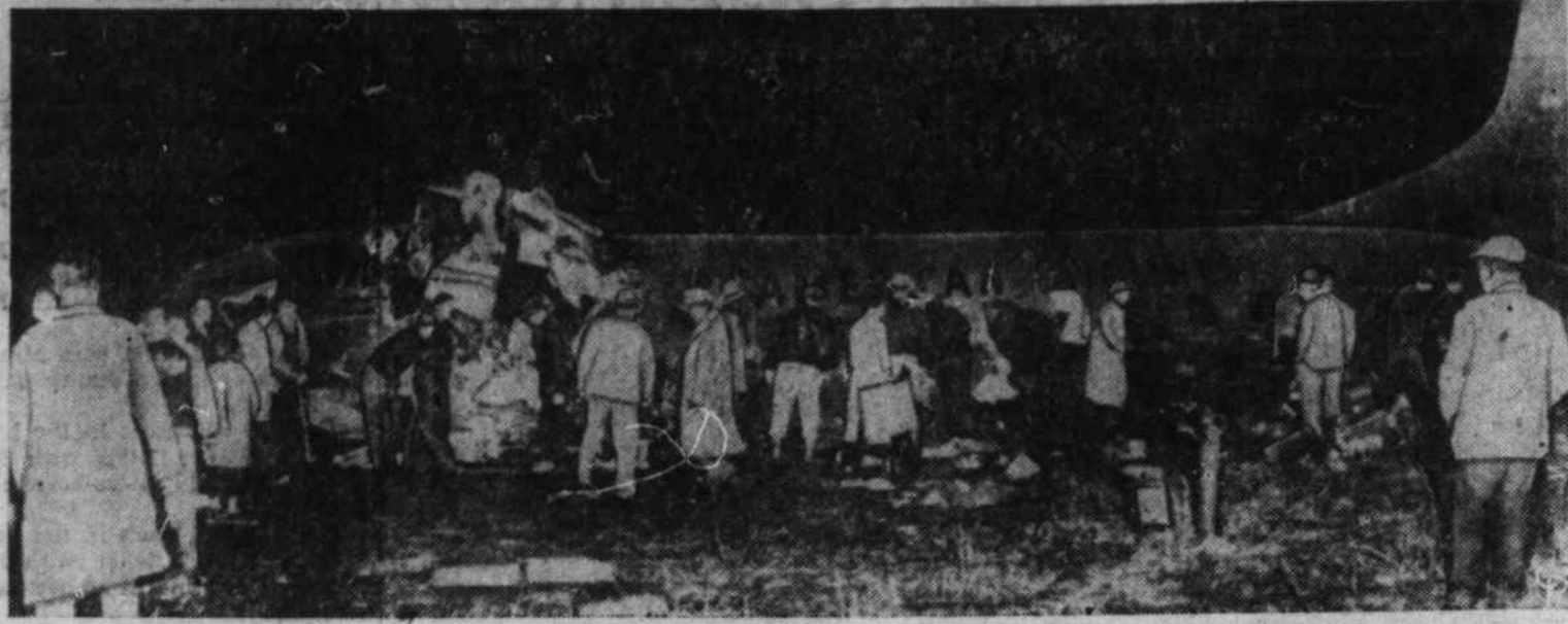
TWELVE PERSONS DIED when this American Airlines plane with 35 persons aboard crashed in a muddy field while approaching the airport at Springfield, Mo. The transport was bound for Tulsa, Okla., from Newark, N. J., when it went down. Twenty-three were injured.