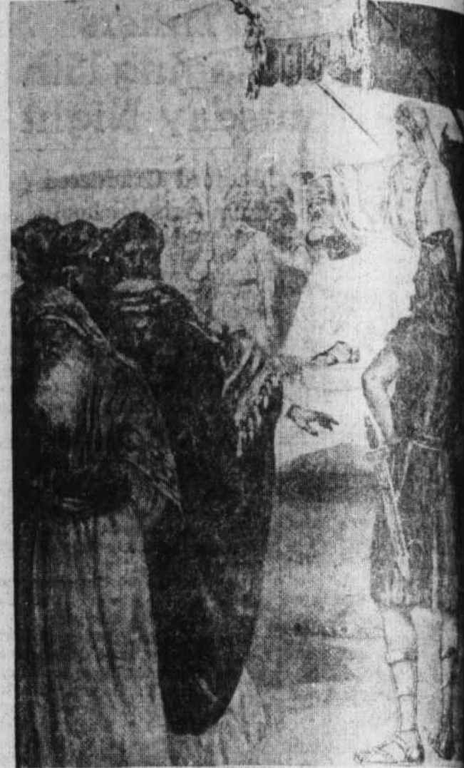
Rehoboam forsakes the council of the old men. "If any of you lack wisdom, let him ask of God, that given him liberally, and upbraideth not; and it shall be given him James 1:5.