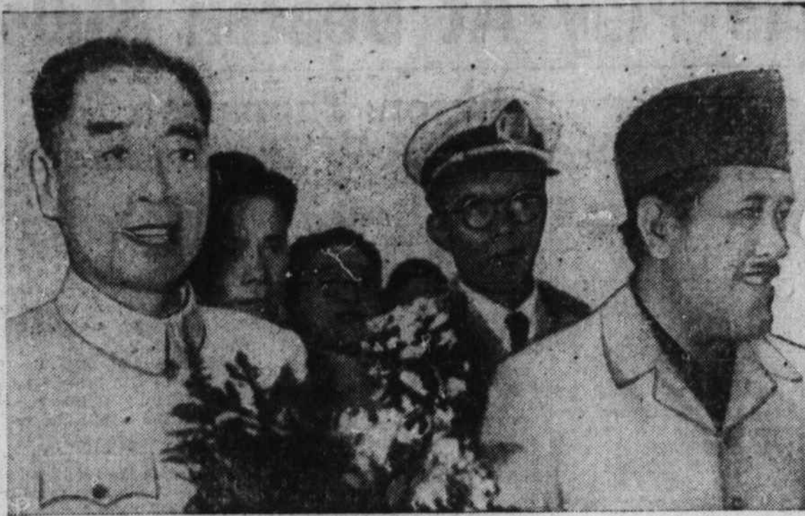
PRIME MINISTER Chou En-lai (left), of Red China, holds flowers presented to him on his arrival at Bandung, Indonesia, for the Asian-African Conference by Indonesian Prime Minister Ali Sastroamidjojo (right), who met him at the airport. Sastroamidjojo, elected conference president, told the delegates of 29 nations that the stockpiling of atomic bombs would lead to war.