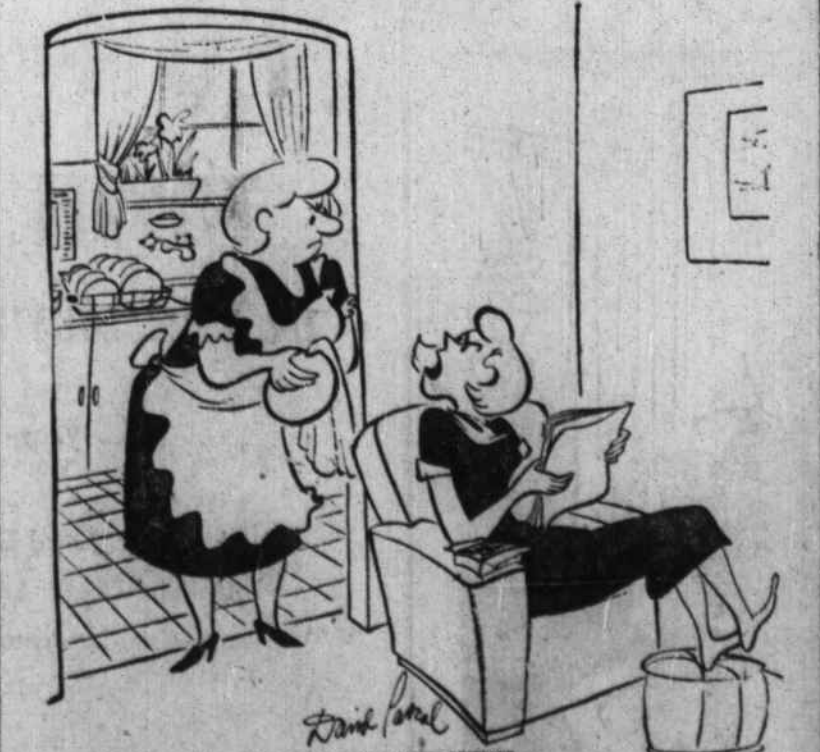
"Listen, Mother, if you don't stop picking on me I'll go home to my husband."