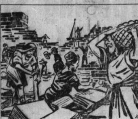
When the chest was full the Levites took it to the king's office. Workmen were hired and they "wrought, and the work was perfected by them, and they set the house of God in His state, and strengthened it."