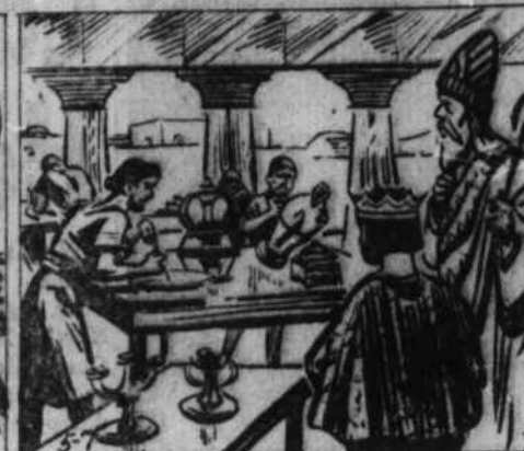
When the repairs were finished the rest of the money was taken to the king and priest Jehoiada and they used it to have vessels of gold and silver made to furnish the temple.