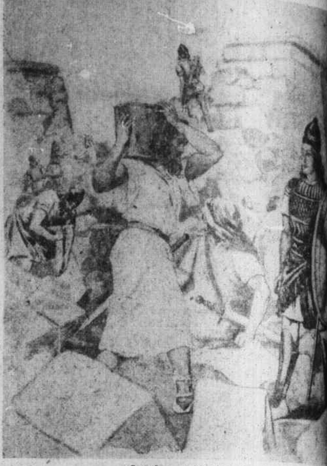
Joash repairs the temple. "Bring sacrifices and thank offerings into the house of the Lord." II Chronicles 29:31.