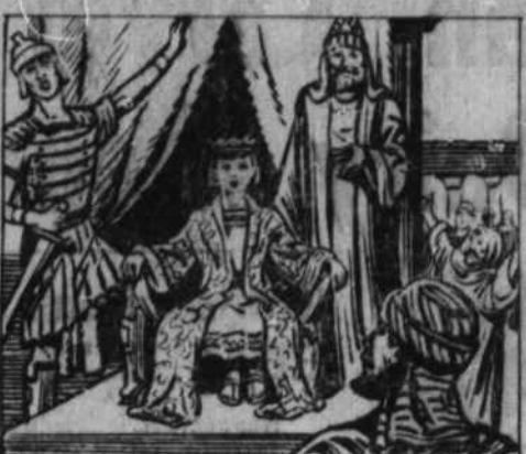
Joash, infant son of Ahaziah, was hidden by his aunt, when his brothers were slain. When he was seven years old, however, the priest Jehoiada and the princes, brought him out and crowned him king.