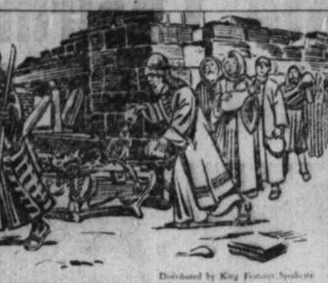
King Joash wanted to repair the house of the Lord. He ordered the Levites to gather the money, but they were slow to do so. Joash chided them, then had a chest made and put at the temple gate and it was filled.