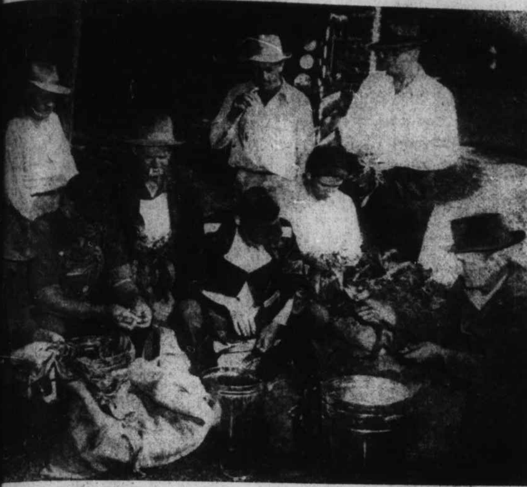
PICKERS are now busy at the Moody Dellwood preparing 100 bushels of counas to the onion. The ramps were picked

in the Dellwood-Maggie section by a crew of 15 men and boys, who worked for six days.