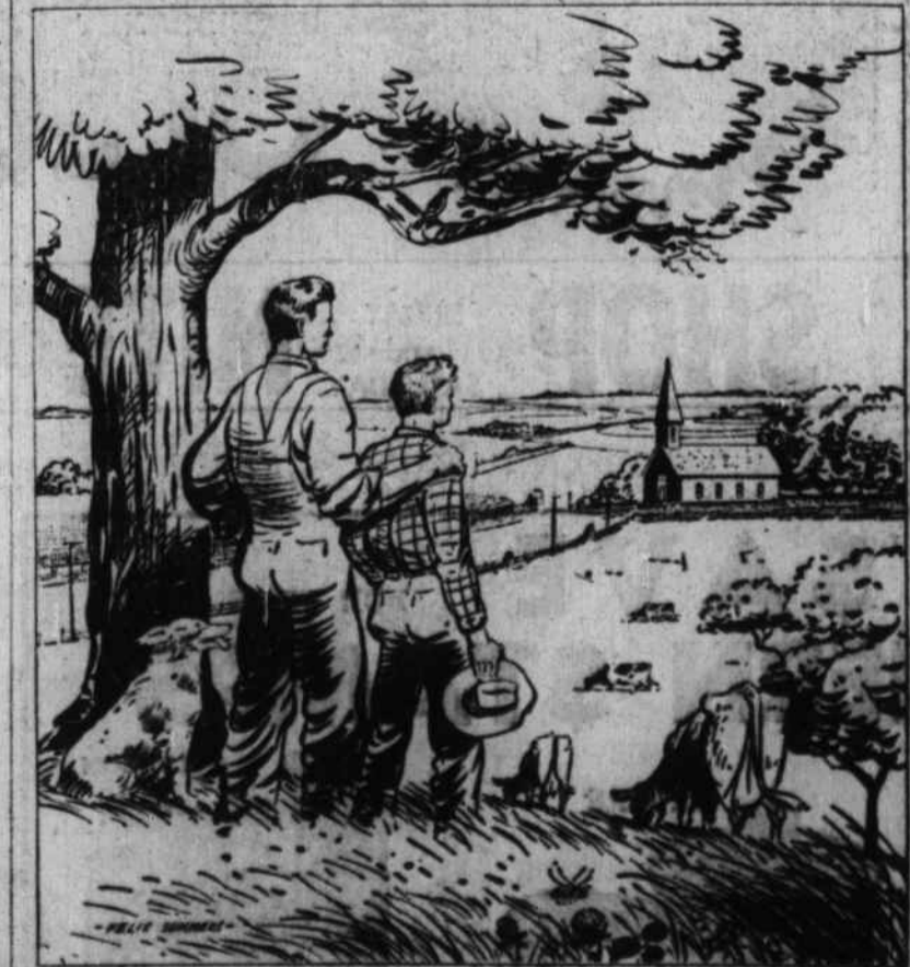
WHAT IS GOOD FOR THE SOIL IS GOOD FOR THE SOUL