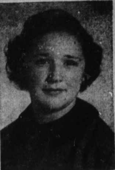
FRANCES EMMA YATES