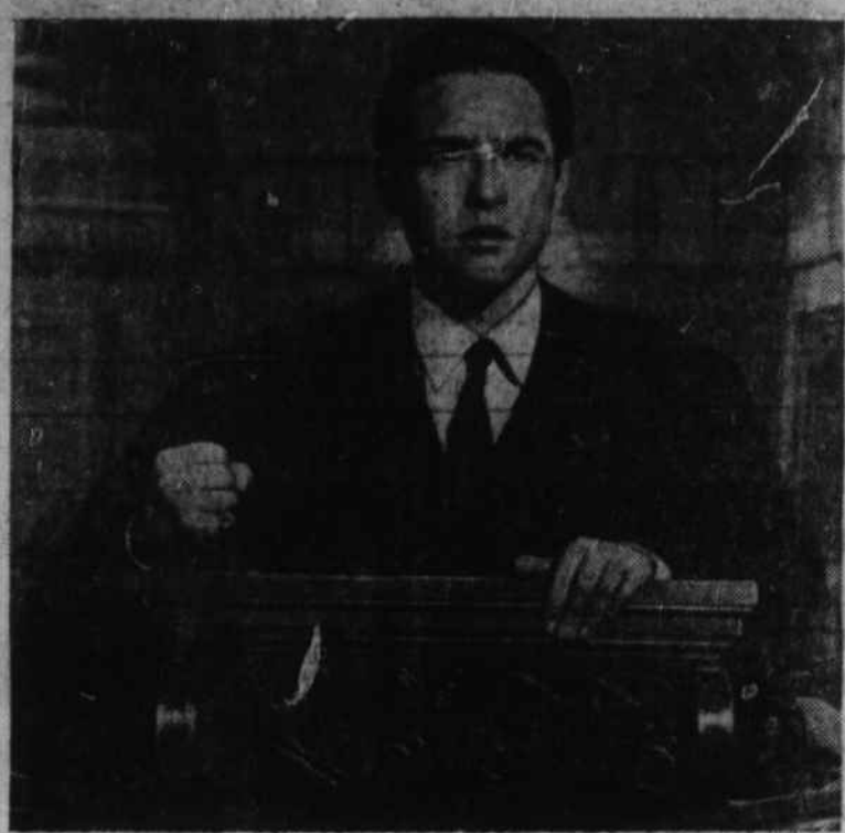
RICHARD TODD delivers one of Peter Marshall's famous sermons vigorously in the CinemaScope version of the best-selling biography by the late minister's wife, Catherine Marshall, "A Man Called Peter," now playing at the Strand Theatre. Jean Peters plays Mrs. Marshall in the Twentieth Century-Fox offering, photographed in color by De Luxe.

Upon completion of the operation May 28, each of the more than 6,000 men in the regiment will know what is expected of him and his unit in such a move.