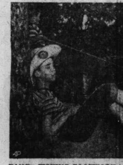
FANCY FISHING FOOTWORK is displayed by this youngster as he tries his luck from the bank of a lake—just as the sport used to be done before it became a highly developed art and science.

The last scheduled 20-round heavyweight championship fight was held on March 21, 1941 between Joe Louis and Abe Simon. Louis knocked out Simon in 13 rounds.