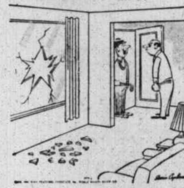
"Mind if I play through?"