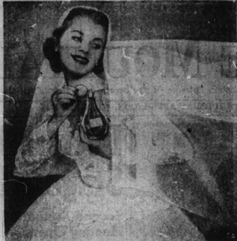
LIGHTER THAN SPRINGTIME is the fragrance of this happy bride inspired by her Chantilly lace gown.

OOPS, CAREFUL! Don't take chances on broken glass or sharp shells at the beach. Wear beach shoes and be safe.