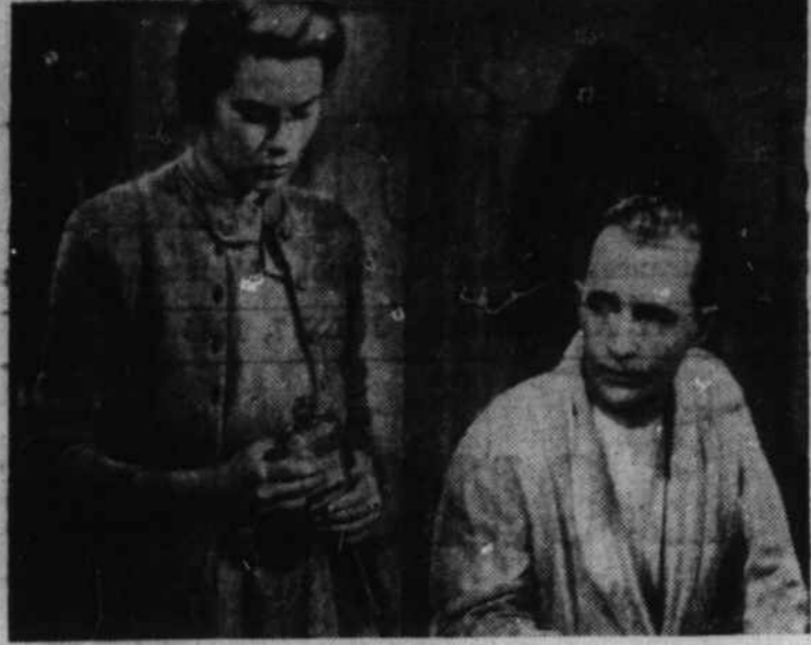
BING CROSBY AND GRACE KELLY as husband and wife in Paramount's "The Country Girl," due Sunday at the Strand Theatre, give award-winning performances. They are co-starred with William Holden in this great Perleberg-Seaton Production.

THE COUNTRY GIRL Starring GRACE KELLY WILLIAM HOLDEN