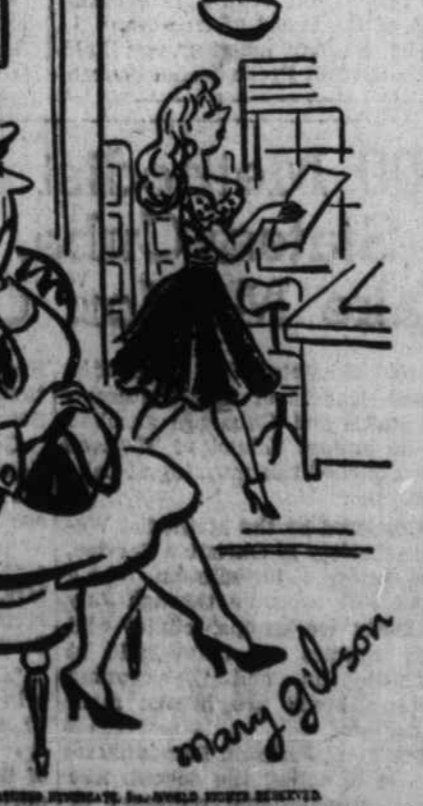
"There's no need to be jealous of my secretary, dear. She can't walk nearly as well as you."